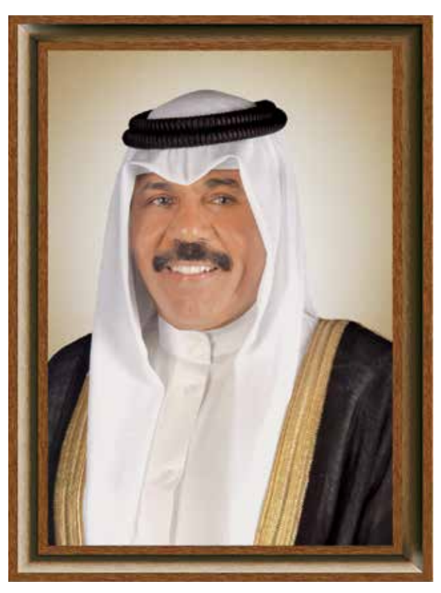
H.H.Sheikh Nawaf Al-Ahmad Al-Jaber Al-Sabah The Crown Prince