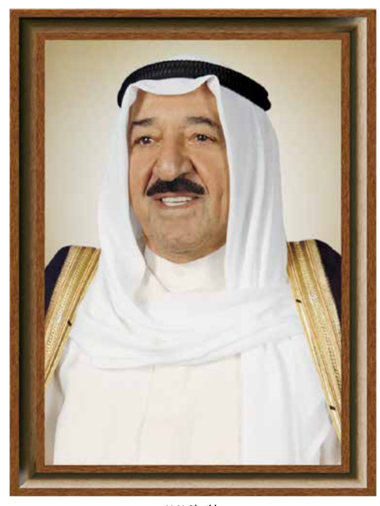
H.H.Sheikh Sabah Al-Ahmad Al-Jaber Al-Sabah The Amir of the State of Kuwait