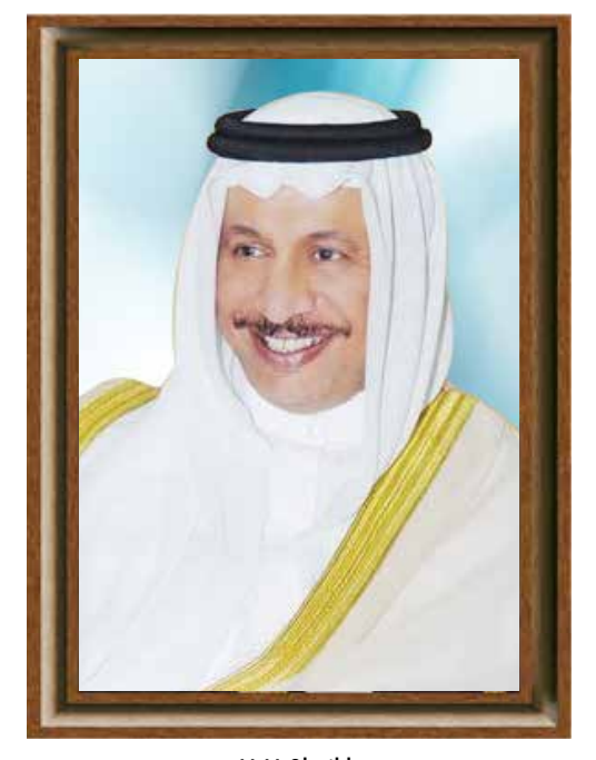
H.H.Sheikh Jaber Al-Mubarak Al-Hamad Al-Sabah The Prime Minister